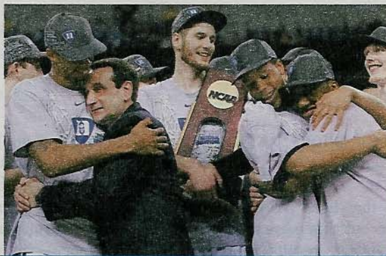
2010: Coach K and his Duke team top Butler 61-59 ...

Jerry Colangelo, USA Basketball senior team director and chairman of the Phoenix Suns, chose Krzyzewski to resurrect a program that was stunned by Argentina in the 2004 Olympic semifinals and settled for