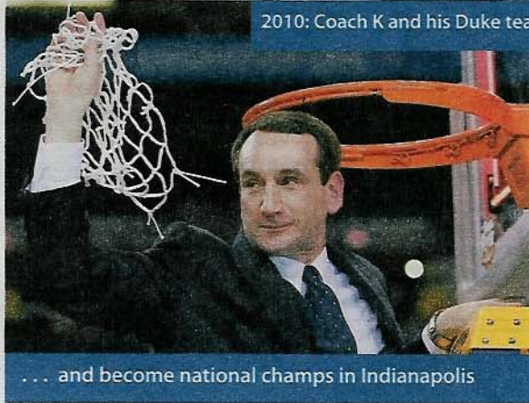
... and become national champs in Indianapolis

bronze. Krzyzewski fit two critical criteria for Colangelo: He bled red, white and blue since his days at West Point and he was a consistent winner.