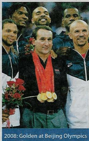
2008: Golden at Beijing Olympics

"I am still hungry and believe me, I still have a sense of urgency," he says. "My team sees it in every ballgame." ❏